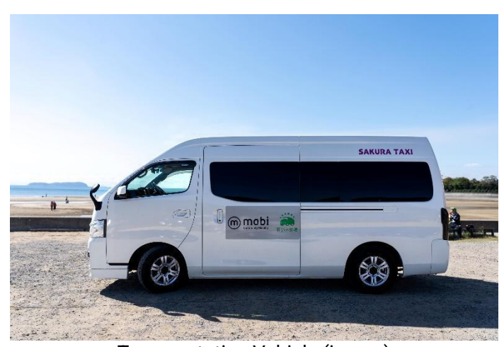
Transportation Vehicle (image)